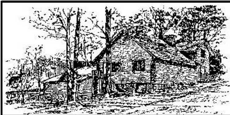
B.U.L Cabin Lake Telemark, New Jersey Pen and Ink Sketch by Don Tripp '94

NOR-BU LODGE SUPPORTS A DEMENTIA FRIENDLY SOCIETY