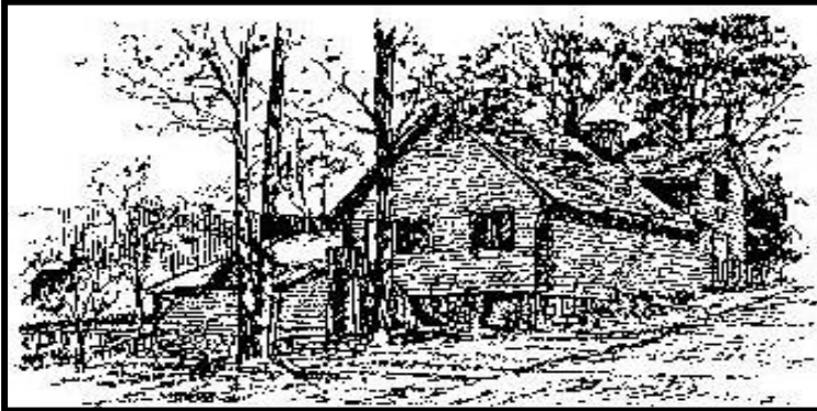
B.U.L Cabin Lake Telemark, New Jersey Pen and Ink Sketch by Don Tripp '94

NOR-BU LODGE SUPPORTS A DEMENTIA FRIENDLY SOCIETY